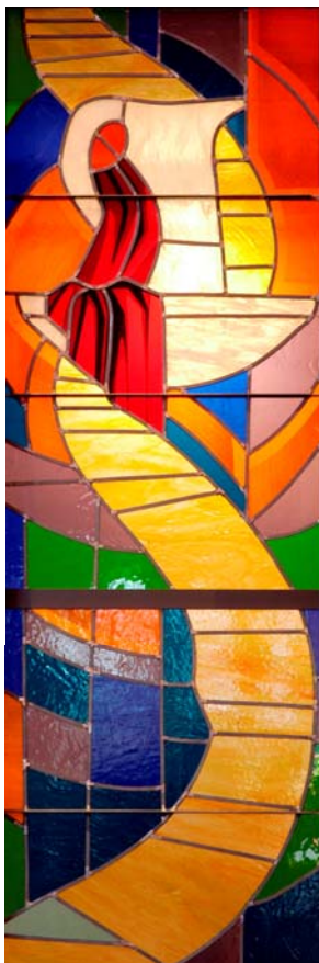
Detail from Stewardship Window, Vienna Baptist Church